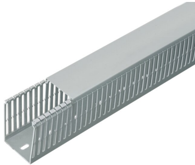
IMMAGINE RAPPRESENTATIVA REPRESENTATIVE IMAGE

Canalizaciones > Cableado > Canales de cuadro > Canaletas ranuradas libres de halógenos > Sistemas de canales ranurados > Gris claro - tipo s - ranuras estrechas 4/6/4