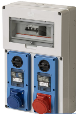
IMMAGINE RAPPRESENTATIVA EC REPRESENTATIVE IMAGE

Industrial > Distribution boards > Distribution boards > Series dbo - board system > Cee socket outlet combination (iec 60309) > 2x16-32a vertical interlocked sockets - with fuse holder