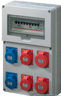
IMMAGINE RAPPRESENTATIVA EC REPRESENTATIVE IMAGE

Industrial > Distribution boards > Distribution boards > Series dbo - board system > Cee socket outlet combination (iec 60309) > 6x16 a sockets