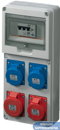
IMMAGINE RAPPRESENTATIVA EC REPRESENTATIVE IMAGE