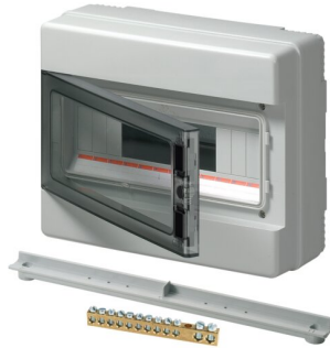
IMMAGINE RAPPRESENTATIVA EC REPRESENTATIVE IMAGE

Enclosures > Wall-mount > Wall modular enclosures > Series 620 - ip65 modular enclosures > Small distribution board > Grey - equipped