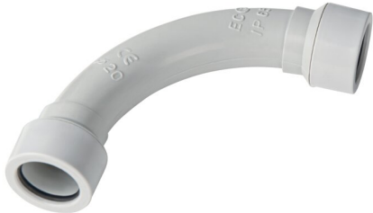
IMMAGINE RAPPRESENTATIVA REPRESENTATIVE IMAGE

Conduits and fittings > Accessories and fittings > Joints and fittings > Speed system - ip65 fittings > Coupler bend conduit - conduit > 90° bend