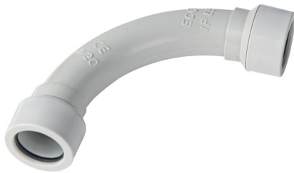
IMMAGINE RAPPRESENTATIVA REPRESENTATIVE IMAGE

Conduits and fittings > Accessories and fittings > Joints and fittings > Speed system - ip65 fittings > Coupler bend conduit - conduit > 90° bend