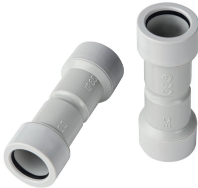
IMMAGINE RAPPRESENTATIVA REPRESENTATIVE IMAGE

Conduits and fittings > Accessories and fittings > Joints and fittings > Speed system - ip65 fittings > Joint conduit - conduit > Joint conduit - conduit