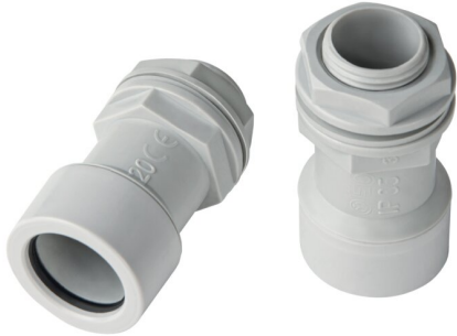
IMMAGINE RAPPRESENTATIVA EC REPRESENTATIVE IMAGE

Conduits and fittings > Accessories and fittings > Joints and fittings > Speed system - ip65 fittings > Coupler conduit-box > Coupler conduit-box