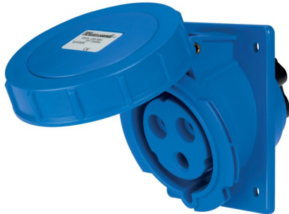
IMMAGINE RAPPRESENTATIVA EC REPRESENTATIVE IMAGE

Industrial > Plugs and sockets > Panel and wall-mount > Panel sockets > Panel-mounted cee socket outlet (iec 60309) > Ip67 - 16 a