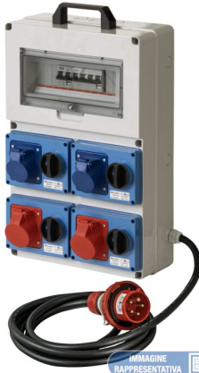
IMMAGINE RAPPRESENTATIVA EC REPRESENTATIVE IMAGE

Industrial > Distribution boards > Distribution boards > Series asc - board system > Cee socket outlet combination (iec 60309) > 4x16 a - 32 a horizontal interlocked sockets