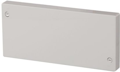
IMMAGINE RAPPRESENTATIVA REPRESENTATIVE IMAGE

Enclosures > Wall-mount > Grp enclosures > Accessories > Accessories for distribution board > Modular chassis blank plate