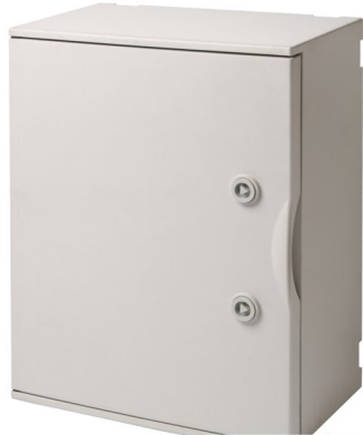
IMMAGINE RAPPRESENTATIVA REPRESENTATIVE IMAGE

Enclosures > Wall-mount > Grp enclosures > Boards > Distribution board > Blank door