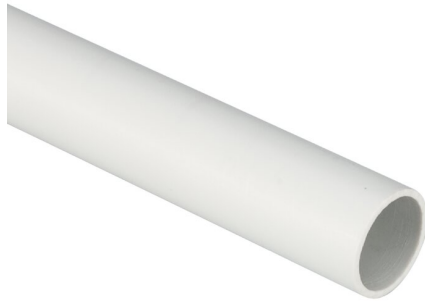
IMMAGINE RAPPRESENTATIVA REPRESENTATIVE IMAGE

Conduits and fittings > Conduits > Rigid conduits > Series tg21 - pp - class 33421 - 750 n > plastic conduits > 3 meters - lenght