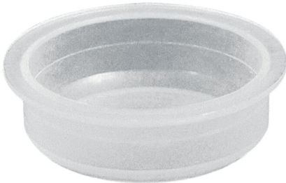
IMMAGINE RAPPRESENTATIVA REPRESENTATIVE IMAGE