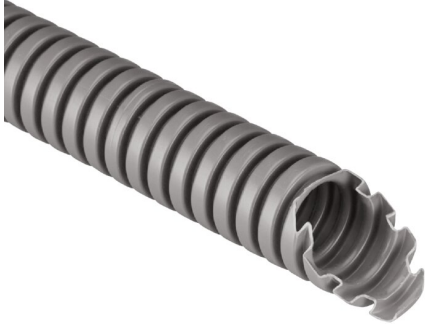
IMMAGINE RAPPRESENTATIVA EC REPRESENTATIVE IMAGE

Conduits and fittings > Conduits > Corrugated conduits > Series tc18 - pvc -25°C - class 33412 - 750 n > plastic conduits > Grey