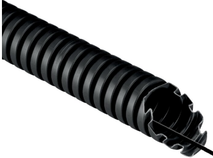
IMMAGINE RAPPRESENTATIVA EC REPRESENTATIVE IMAGE

Conduits and fittings > Conduits > Corrugated conduits > Series tc15 - pvc - class 33212 - 750 n > plastic conduits > Black - cable puller