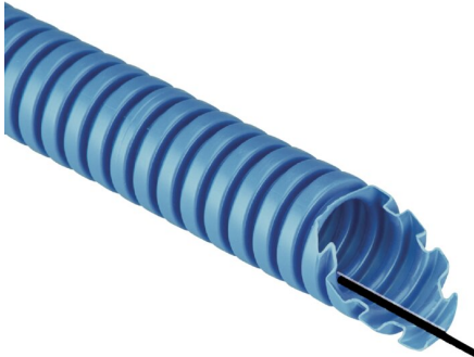
IMMAGINE RAPPRESENTATIVA EC REPRESENTATIVE IMAGE

Conduits and fittings > Conduits > Corrugated conduits > Series tc15 - pvc - class 33212 - 750 n > plastic conduits > White - cable puller