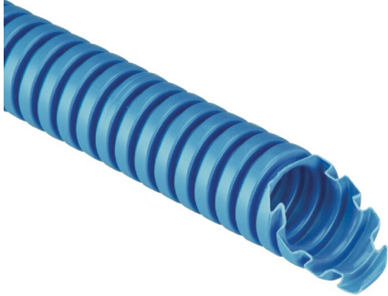
IMMAGINE RAPPRESENTATIVA REPRESENTATIVE IMAGE

Conduits and fittings > Conduits > Corrugated conduits > Series tc15 - pvc - class 33212 - 750 n > plastic conduits > White