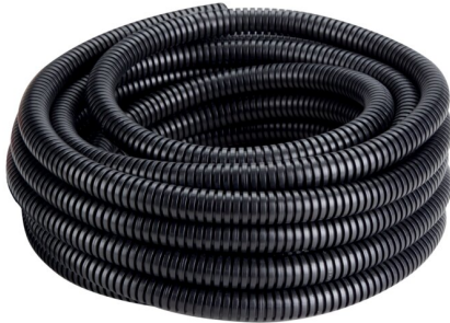
IMMAGINE RAPPRESENTATIVA REPRESENTATIVE IMAGE

Conduits and fittings > Conduits > Corrugated conduits > Series tc15 - pvc - class 33212 - 750 n > plastic conduits > Black - 10 meters-roll