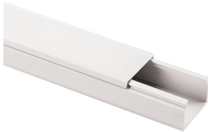
IMMAGINE RAPPRESENTATIVA REPRESENTATIVE IMAGE

Trunkings > Wall and ceiling > Miniature solid trunkings > Series mc - front lid > Mini/maxi trunkings > White