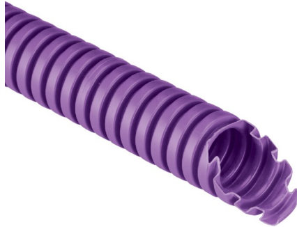
IMMAGINE RAPPRESENTATIVA REPRESENTATIVE IMAGE

Conduits and fittings > Conduits > Corrugated conduits > Series icta - pp - class 34223 - 750 n > plastic conduits > Black