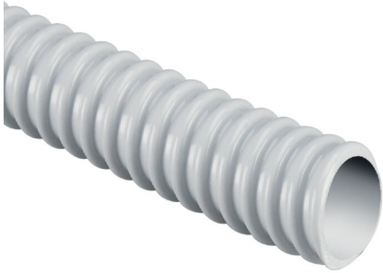
IMMAGINE RAPPRESENTATIVA EC REPRESENTATIVE IMAGE

Conduits and fittings > Spiral conduits > Flexible spiral conduits > Series gfe - class 23114 - 320 n > Spiral flexible conduits