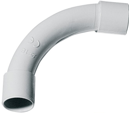
IMMAGINE RAPPRESENTATIVA REPRESENTATIVE IMAGE