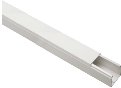
IMMAGINE RAPPRESENTATIVA REPRESENTATIVE IMAGE

Trunkings > Wall and ceiling > Solid cable trunkings > Series cp - trunking lengths > Cable trunkings > Din pitch trunkings