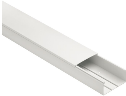
IMMAGINE RAPPRESENTATIVA REPRESENTATIVE IMAGE

Trunkings > Wall and ceiling > Solid cable trunkings > Series cp - trunking lengths > Cable trunkings > White