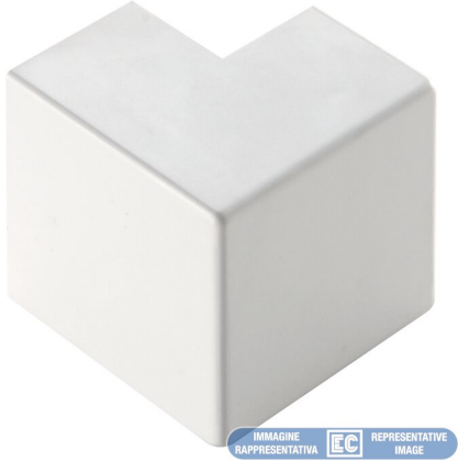
IMMAGINE RAPPRESENTATIVA EC REPRESENTATIVE IMAGE

Trunkings > Wall and ceiling > Solid cable trunkings > Series cp - fittings > Outer corner for cable trunkings