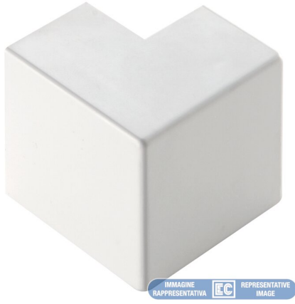
IMMAGINE RAPPRESENTATIVA EC REPRESENTATIVE IMAGE

Trunkings > Wall and ceiling > Solid cable trunkings > Series cp - fittings > Outer corner for cable trunkings